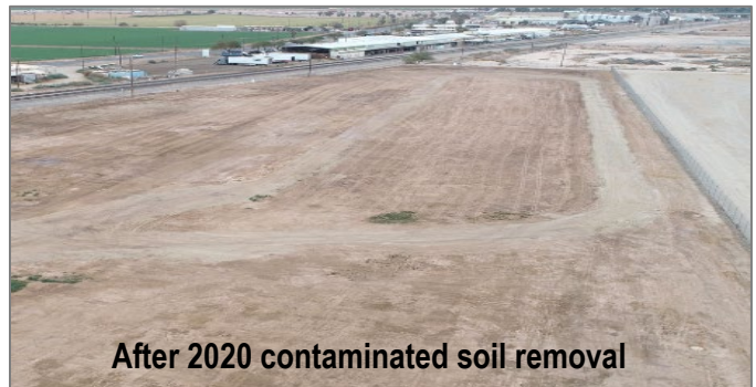
After 2020 contaminated soil removal