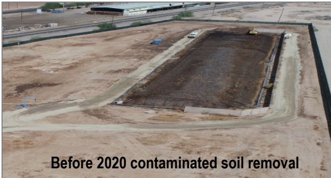
Before 2020 contaminated soil removal

December 2020: The contaminated stockpile was removed in 2020 (see the before and after photos). All safety rules were followed, and air monitoring demonstrated dust did not leave the site.